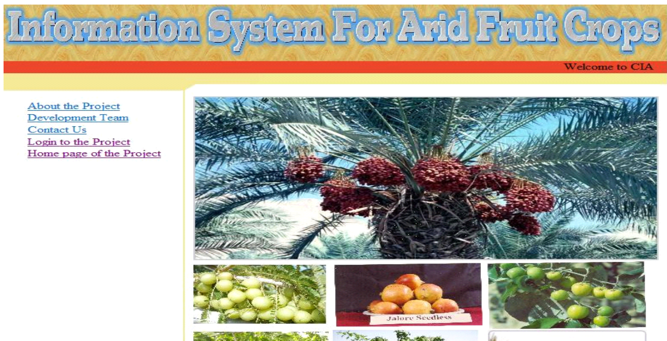
Fig 1. Home Page of Information System for Arid Fruit Crops

On selecting the Disease management sub module by the user in Production management, user gets the disease management main module. This page was designed to display the list of diseases of the selected crop. When the user selects the disease of the crop he will get the page which contains 3 sub modules namely 1- Photo gallery of the disease. 2- Details of the disease. 3- Disease management. On selecting the photo gallery of disease option user gets the photos of the selected disease of the crop. The selected photos can be enlarging to examine the disease clearly. The system provides detail information of the disease of selected crop by selecting the details of disease sub module. When the user selects the disease management option he will get the information about control measures of the selected disease for selected fruit crop. Similar to production management user can select the any one option of the sub modules of Statistics of fruit crop and