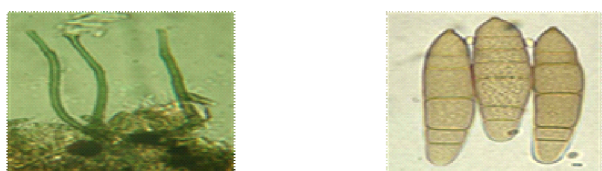
A- CONIDIA OF NCLB

The fungus causing NCLB overwinters as mycelia and conidia on corn residues left on the soil surface. The conidia are transformed into thick-walled resting spores called chlamydospores. During Warm, humid conditions, new conidia are produced on infested corn residues. These conidia acting as primary source of inoculums are spread when splashed by rain or carried by wind from distant areas and deposited on the surfaces of corn leaves. Once deposited, conidia germinate when free water mainly in the form of dew is present on the leaf surface for 6 to 16 hrs and temperature of 18-24°C. Conidia germinates developing a germ tube which penetrates through stomata, and invades the parenchyma cells. Dispersal of the fungus from both near and distant sources is important in the epidemiology of the disease. In moist temperate conditions, the fungus overwinters as mycelium and conidia produced on corn residues are left on the ground surface. In those conditions, the conidia can also develop into chlamydospores, thick-walled resting spores that remain viable for long periods of time. Five physiological races of the NCLB fungus are reported and infection associated with host dependent different genera and species on the race (Fig. 2).