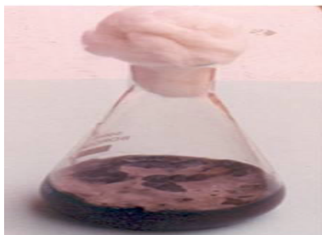
B- Multiplication on PDA