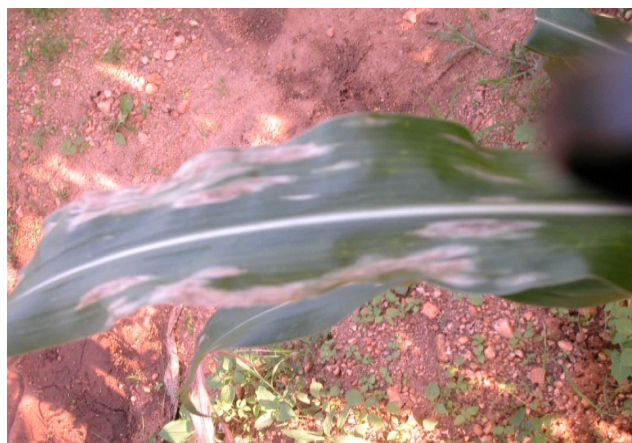
Fig. 1 Northern Corn Leaf Blight

The disease symptoms primarily appear on the leaves. Plants may be infected at any growth stage, but usually at or after anthesis. The disease starts first as a small elliptical spot on the leaves, grayish green in colour with water soaked lesions. The spots turn greenish with age and increase in size, finally attaining a spindle shape. Individual spots are usually 3/4" wide and 2" to 3" long. Spores of the fungus develop abundantly on both sides of the spot. Heavily infected field presents a scorched appearance (Fig.1).