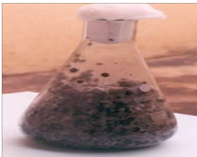
C- Multiplication on Sorghum grains