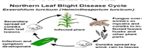
B- DISEASE CYCLE