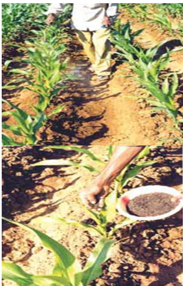
D- Creation of artificial inoculation in field Fig. 3 Procedure for Inoculation A, B, C and D